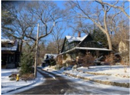
Wendigo way, High Park